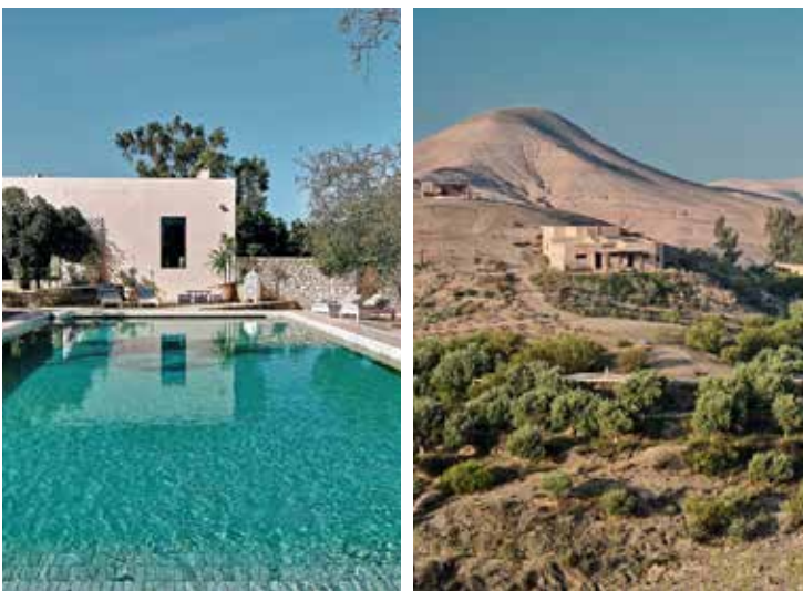
From left: poolside at Les Jardins de Villa Maroc; La Pause's spectacular desert locale

There are three main things to do: pool time, camel rides during the golden hour (as anyone who has ridden a camel knows, this is primarily for the photo op, but in this landscape, the light and shadows of the late afternoon are, in fact, magnificent) and food. Lunch is pleasant, but dinner is what really impresses. Tables are set beneath tents and among the scrubby trees of the desert oasis. The only light is from candles, lanterns and bonfires. Busloads of dinner-only guests arrive from Marrakech. And then the servers begin their intricate choreography of carrying tagines through the darkness to the low-lit tables. The confidence of it all adds another layer to the romance of Morocco beyond the famous city.